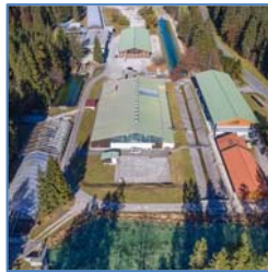
Site of the Research Institute at Obernach

The imposing storage hydropower station is considered the cradle of industrial power generation in Bavaria. Completed in 1924, it was one of the largest hydroelectric power plants in the world at the time with an output of 124 MW. Down the road in Obernach, the Institute of Hydraulic Engineering and Water Resources at TUM carries out numerous research projects at its satellite Research Institute.